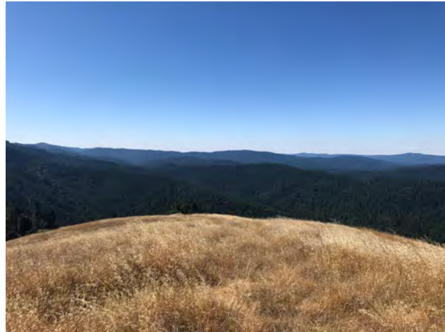
Panoramic view from Wellman Point, the highest point of the Weger Working Forest