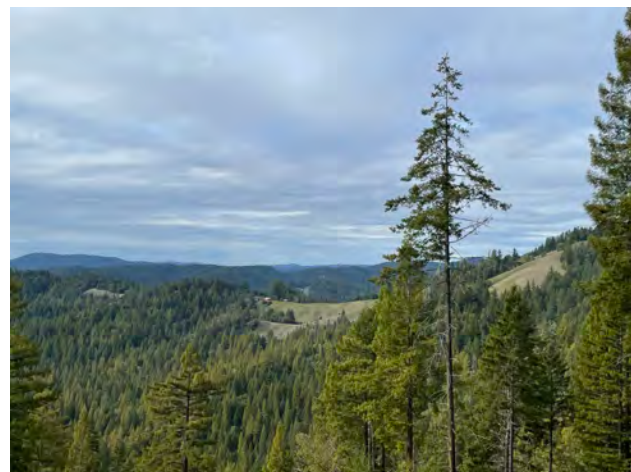
Weger Working Forest, looking northeast

Save the Redwoods League (League), in partnership with the landowners of the Weger Working Forest, respectfully submit this proposal to the Forest Legacy Program to protect, via a conservation easement, an ecologically significant working forest in Mendocino County that is threatened by conversion to non-forest uses. The subject property (Weger South) is part of the larger Weger ownership that consists of a total of 3,862 acres. The property has been owned and managed by the Weger family for generations. The larger property includes three separate conservation easements: Orr Springs (~730 acres), Weger North (~1,552 acres), and Weger South (~1,580 acres). The League expects to acquire two of the easements, Orr Springs and Weger North, in December 2022, and the remaining easement, Weger South, in 2023 or 2024, pending timing of LWCF funds, if awarded. The easements will be managed together as a single, sustainably managed, highly productive redwood and mixed conifer working forest. The west coast of the U.S. is the only place in the world where coastal redwood forest such as this exists. Being the largest non-industrial ownership in the Big River watershed, its protection is of regional and statewide importance.