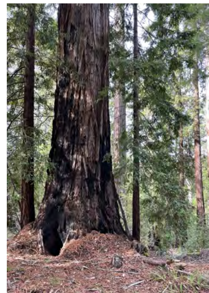
Scattered old growth redwoods are found within the Weger Working Forest