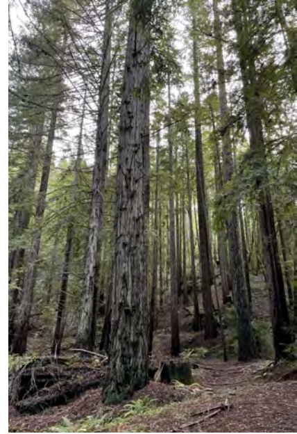
Mature redwoods in Soda Creek drainage